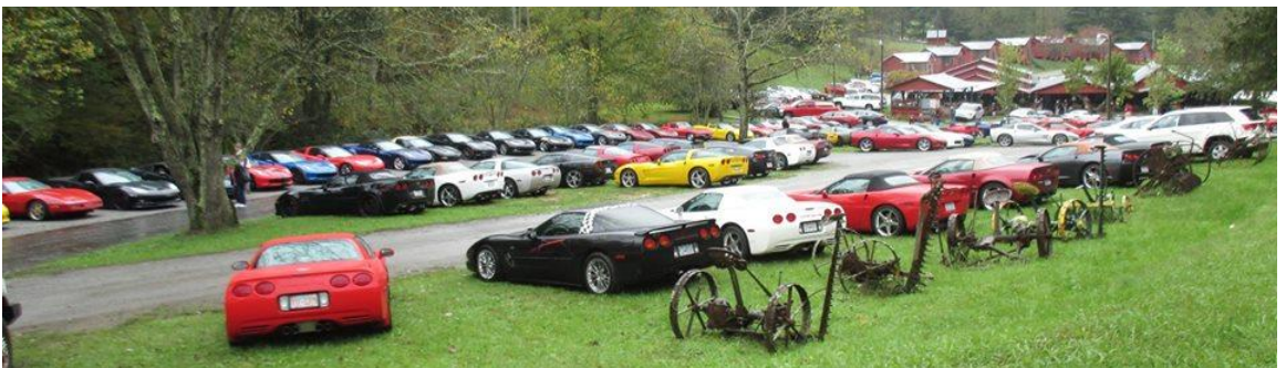
2018 Run to the Colors - Corvette Fall Tour