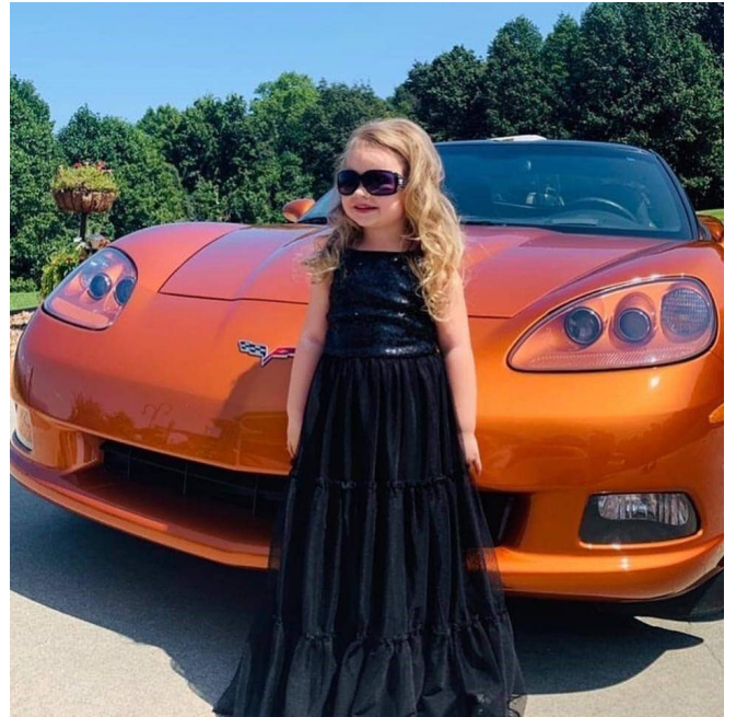
Little Miss Corvette — does she look like anyone you know?

For the 2021 Fall Tour—Run to the Colors this is the color we hope for with a Carolina blue sky. :)