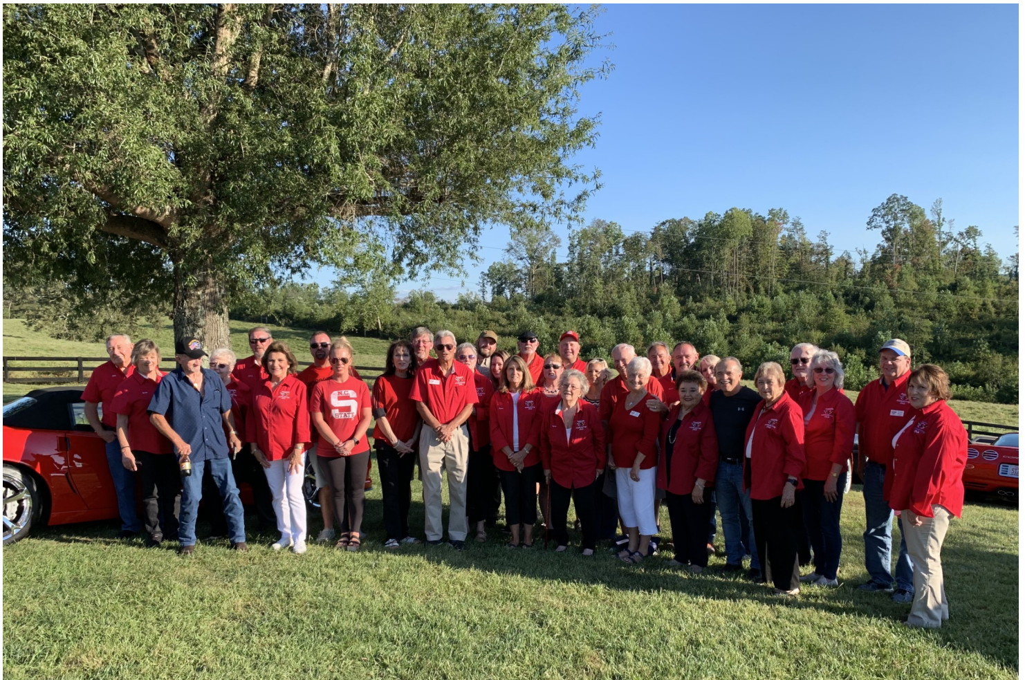
Beautiful Fall Day for a Corvette Outing!