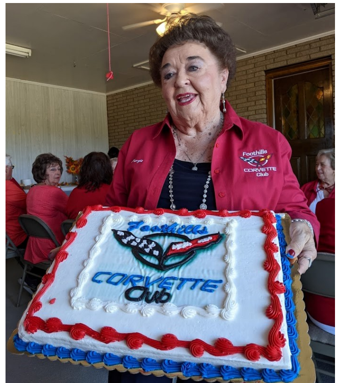
Dessert was beautiful and delicious!